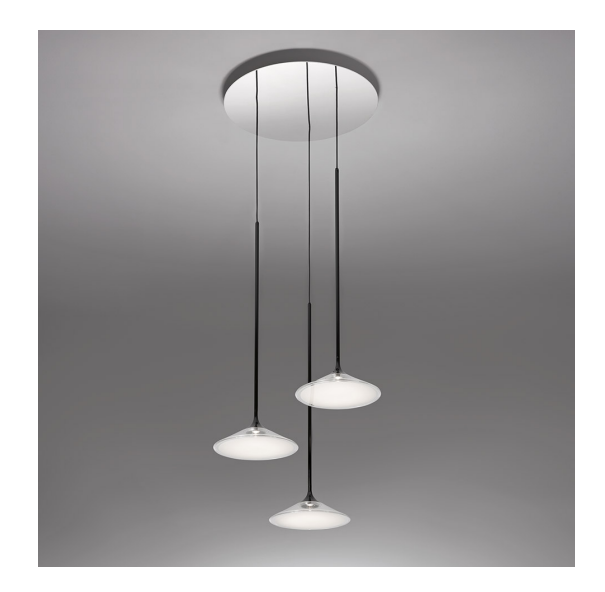
IP 20 (€ Dimmerable: +① -